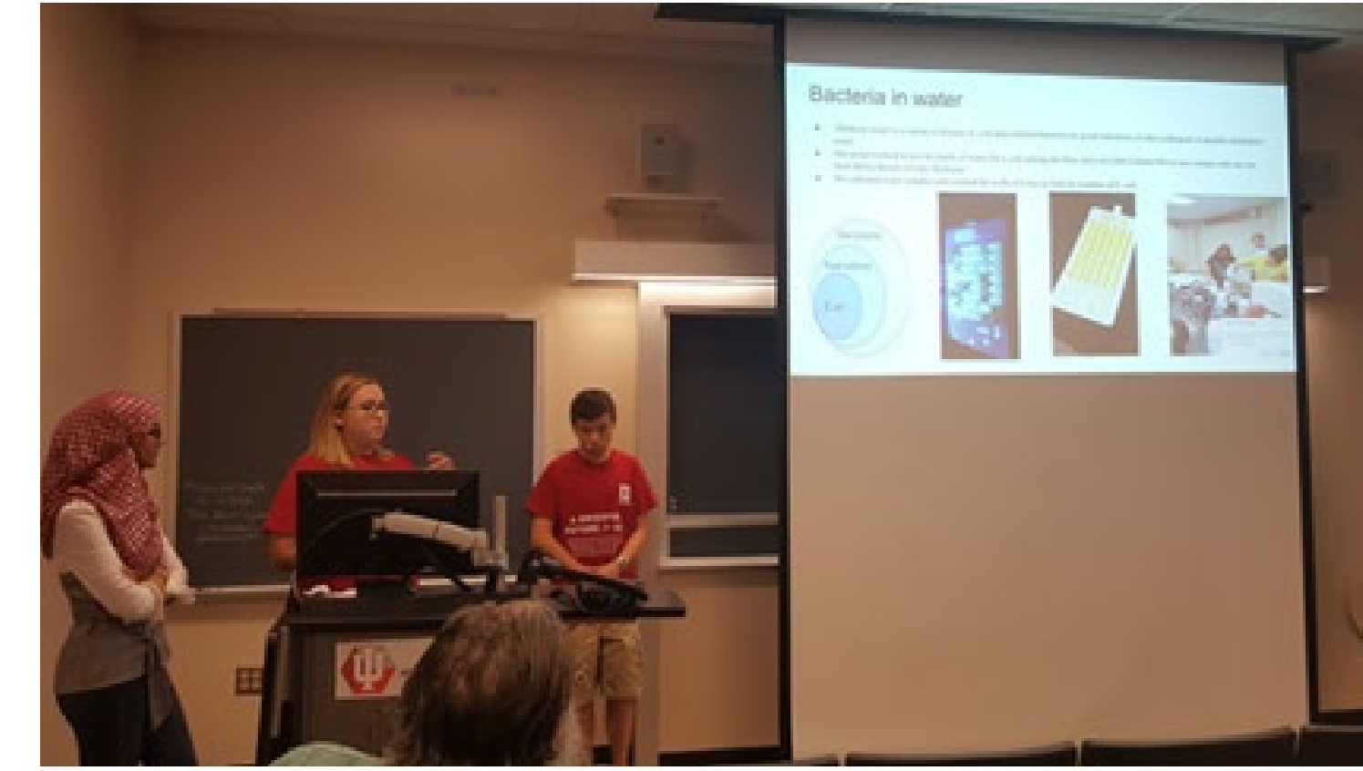
Fig. 5. Orientation final presentation

Academic activities were combined with opportunities for socialization and cohort building. AIMS scholars from the previous cohort participate as student mentors, thus facilitating continuity and community among AIMS Scholar cohorts. Student teams engaged in data collection and analysis, and interpretation and significance of their findings.