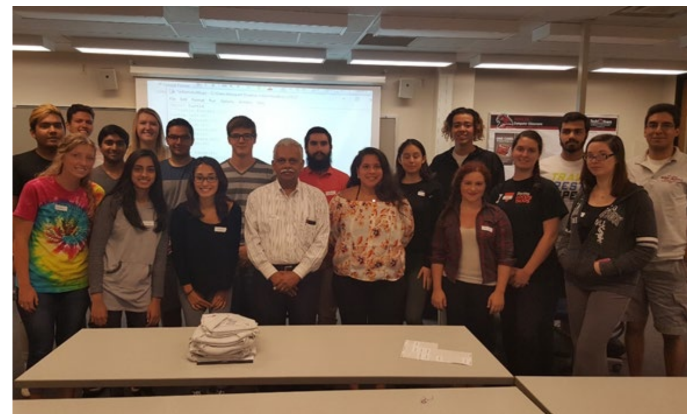
Fig. 1. NSF-AIMS team with first cohort

In the NSF-AIMS program, scholars are linked academically and socially through shared experiences. Academic and peer support are intertwined through placement seminars, peer-led instruction, field trips, First-year STEM seminar, and cohort classes. The scholars have opportunities to become instructional leaders, participate in faculty-mentored research, and internships. One major goal of NSF-AIMS is to increase the number of women, African American, and Hispanic graduates entering STEM-related jobs and graduate programs. Our experiences can inform the NSF and investigators in developing guidelines and proposals for successful S-STEM programs.