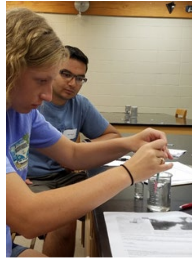
Fig. 4. Water quality testing