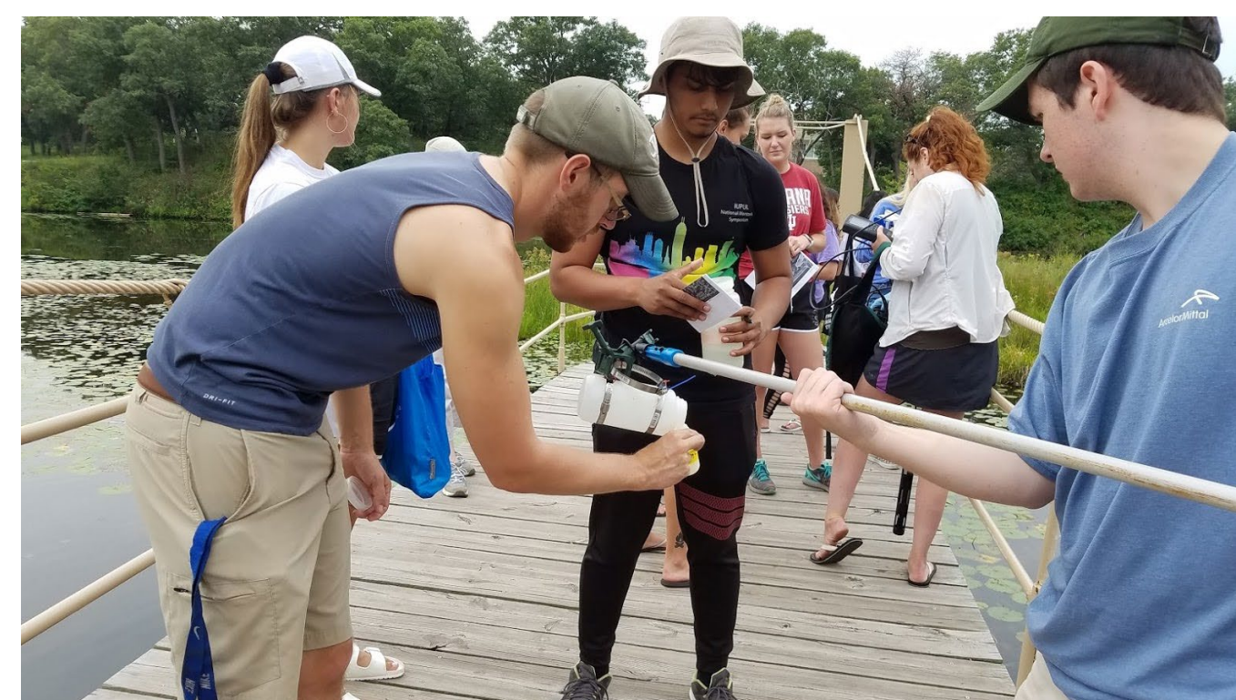
Fig. 2. Students collecting water samples and water quality data using a Sonde probe at the Marquette Park Lagoon in Gary, Indiana

Orientation Activities: The NSF-AIMS orientation takes place the week before classes begin and is required of all NSF-AIMS scholars. The orientation is a week-long activity-based project, where teams of students with faculty and student mentors engage in an interdisciplinary research project. During the first four years of the grant, the orientation was centered around a current and regionally relevant scientific problem (Figures 2-3).