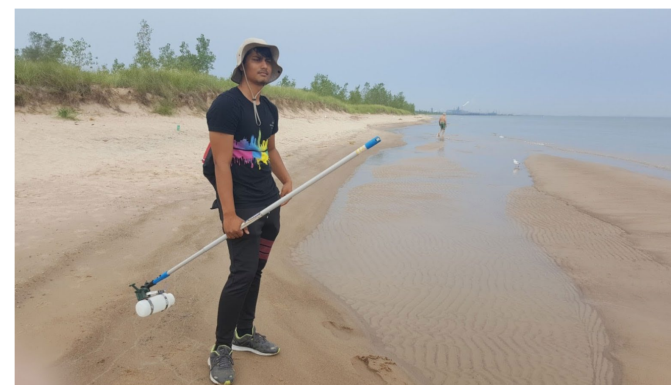
Fig. 8. Water quality sampling at Lake Michigan.

Several scholars presented their undergraduate research at the annual Geological Society of Americas Conference in 2018.